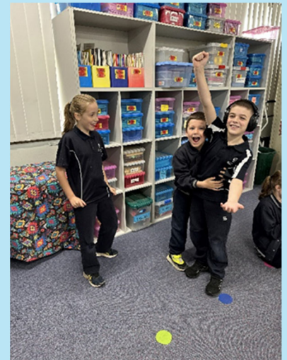
Eureka! We found gold.