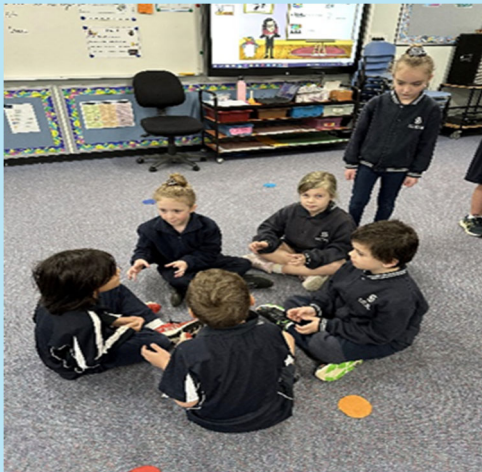
All the children are playing happily at the party, but our character Jamie doesn't want to be there.

In Foundation and Grade 1 students are learning to use their bodies and facial expressions to express emotions. They think about how their character would react in any given situation and try to show that reaction. Students learn how to make freeze frames which represent a moment in time. In these freeze frames we should be able to understand exactly how the character is feeling by their body language and facial expressions.